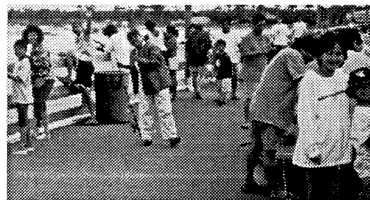
Pictures from our last trip to Panama City, FL. From top to bottom: Some of the kids have fun in the sand, the group poses for a picture, and Filipinos on the pier wait to reel in some fish for dinner.